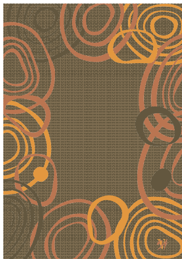
DA- 175 /1

Illustrations are only color representations, verify color against Acrylic yarn samples. Color and size may vary due to the nature of hand-made goods. Slight variation is considered common and acceptable. Specifications are subject to change without notice.