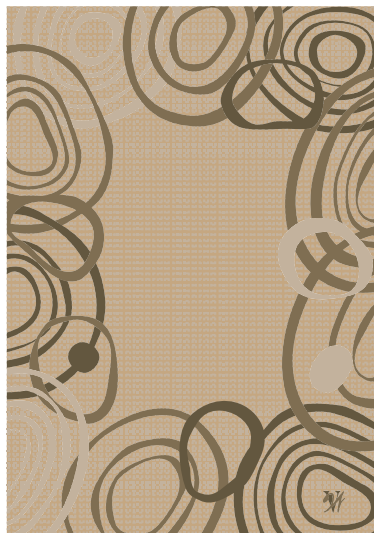
DA- 175 /3